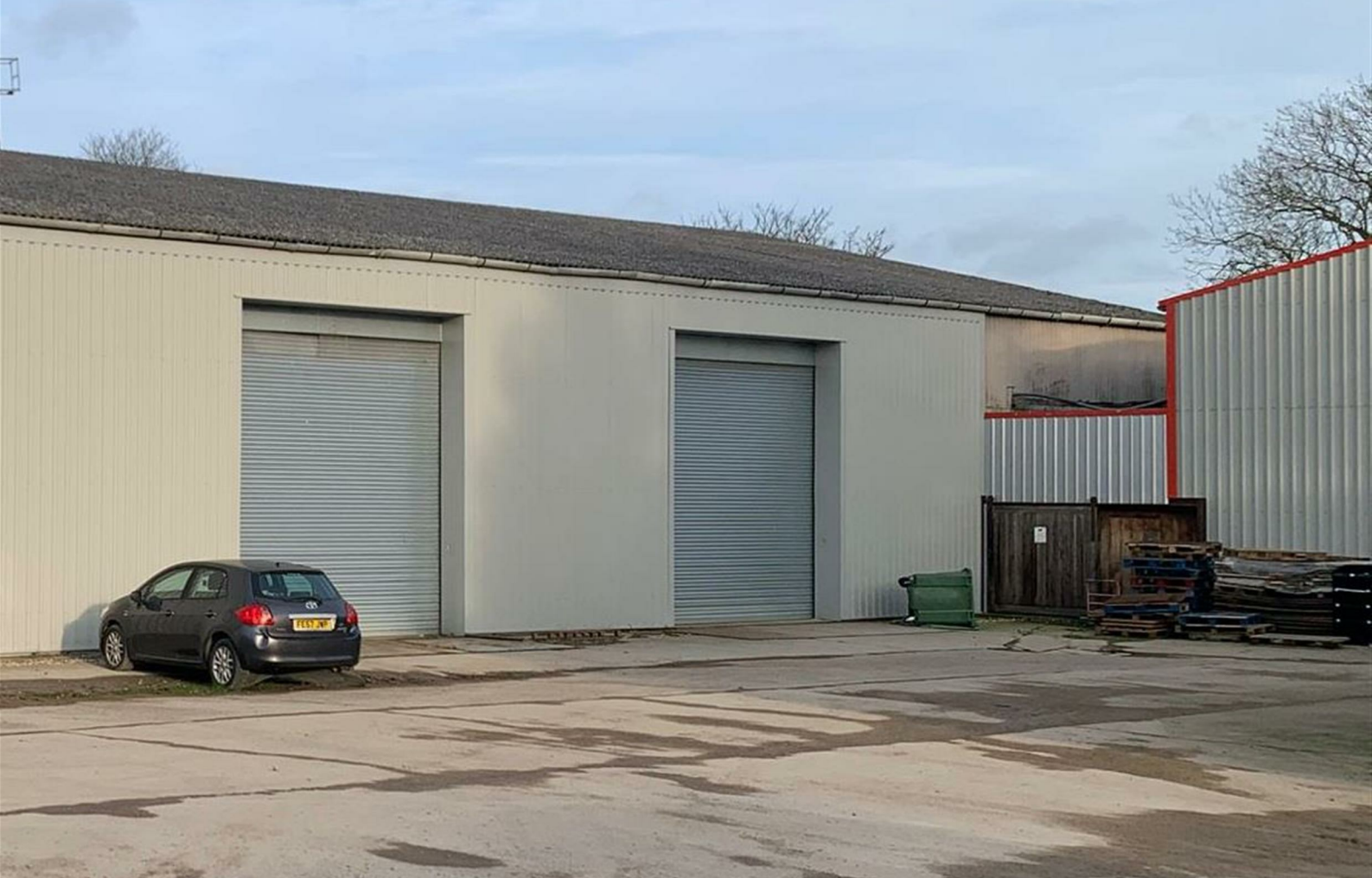
Unit 3, Black Bull Barns, Colsterworth, Grantham NG33 5LL

Industrial Storage/Distribution Unit adjacent to the A1